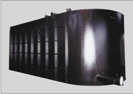
Enclosed Underground Booster Pump Packages.

Special-duty packages for underground service or needs outside our standard packages are a Patterson specialty. With our flexible design concepts, we can engineer a package to meet your needs.