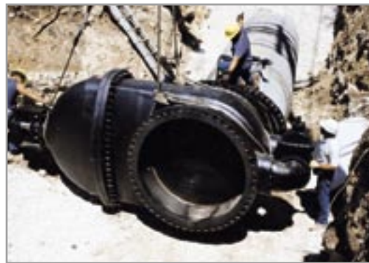
L-R Double-Disc Gate Valve.

Patterson Multi-purpose Vertical Turbine (MPVT®) Pumps are widely used in municipal/ industrial solids handling, water treatment, flood control and water supply applications. Standard units are available with bowl sizes from 12 in. to 40 in. and capacities ranging from 1,500 to 20,000 gpm and above. Easily integrated into existing installations, these pumps operate in low NPSHA applications. Since pump discharge, motor and controller are above grade, component maintenance is easy and safe.