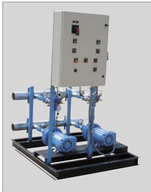
Flo-Pak Aqua-FloPak™ Booster Packages For Plumbing Systems.

Plumbing. Sometimes municipal service is either unavailable or insufficient in pressure or flow. Building owners must turn to plumbing contractors for their water supply solutions. Contractors depend on Flo-Pak Aqua-FloPak™ booster packages to provide independent water systems with efficient, dependable service. Versatile Aqua-FloPak packages also provide dependable water service at controlled volume and pressure for high-rise residential structures, office buildings, dormitories and similar facilities.