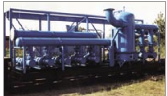
Patterson Flo-Pak® Primary and Secondary Pump Packages.

HVAC. The simplicity of packages in district heating systems and within the building envelope significantly aids maintainability. Patterson has Flo-Pak packages for hydronic heating and heat transfer stations, complete chillers, primary and secondary (booster) pump packages, water source heat pump stations, condenser water pump skids, hot water heating circulators and variable load primary systems.