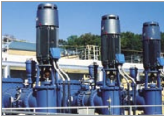
PVT Vertical Turbine Pump Station.

efficiency. They meet Hydraulic Institute Standards in capacities from 50 to over 100,000 gpm, with single stage heads to 550 ft and two stage heads to 1,150 ft. Vertical configurations and custom designs are available.