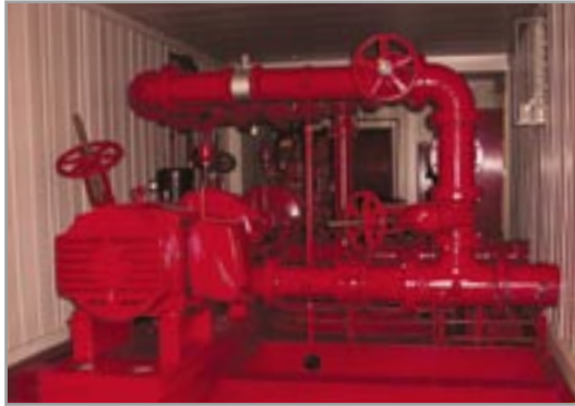
Patterson Pre-Pac® Fire Pump Package.

include suction diffusers, valves (multi-duty, circuit balancing, automatic vent and makeup water pressure reducing), air separators and scoops, heat exchangers (shell & tube and plate & frame), flowmeters, expansion tanks and flexible connectors.