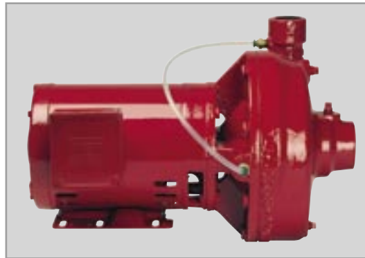
Close-coupled End Suction HVAC Pump.

to the pump volute. Gauge taps at the suction and discharge connections provide complete monitoring flexibility. Special seal and impeller technologies reduce axial thrust to help lengthen maintenance cycles. Precision cast, machined and dynamically balanced impellers minimize vibration and maximize bearing life.