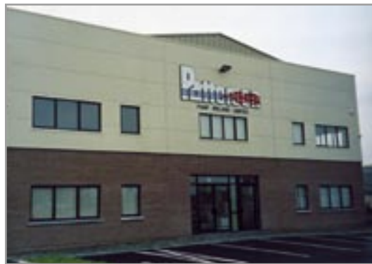
Patterson Mullingar, Ireland, Factory.

Whether in our USA or Ireland factory, the result is high-precision workmanship with rapid delivery, especially important in fulfilling critical needs. Individual skills are integral to whole system quality—the reason our plate shop personnel are fully qualified in accordance with Section IX of the ASME Code for all types of approved welding.