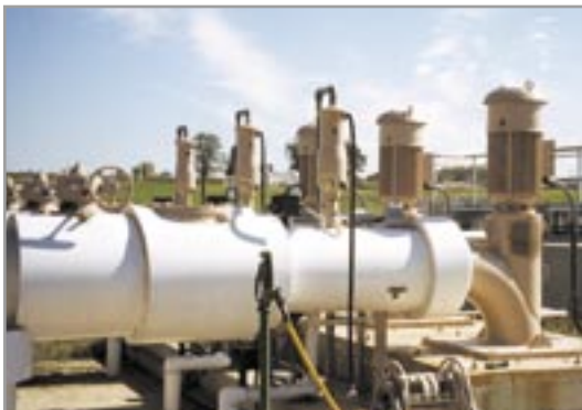
MPVT® Vertical Turbine Pump Station.

Today's Patterson Vertical Turbine Pumps offer benefits gained by years of refinement, with exceptional hydraulic performance and low vibration and noise levels. Multiple stages meet pressure requirements with a minimal footprint. Standard units have cast iron discharge heads and cast iron bronze fitted bowls. Optional stainless steel or aluminum bronze construction is available, and fabricated steel heads in lieu of cast iron are available in both above- and below-grade discharge configurations.